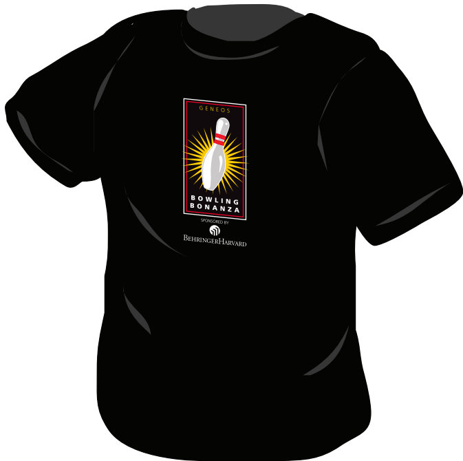
Behringer T-shirts for corporate event