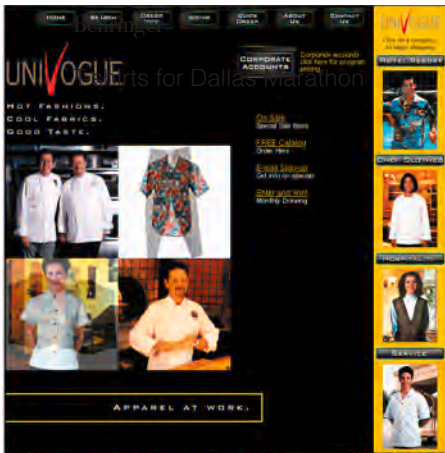
Univogue home page

New design to freshen up the brand from a very dated logo.