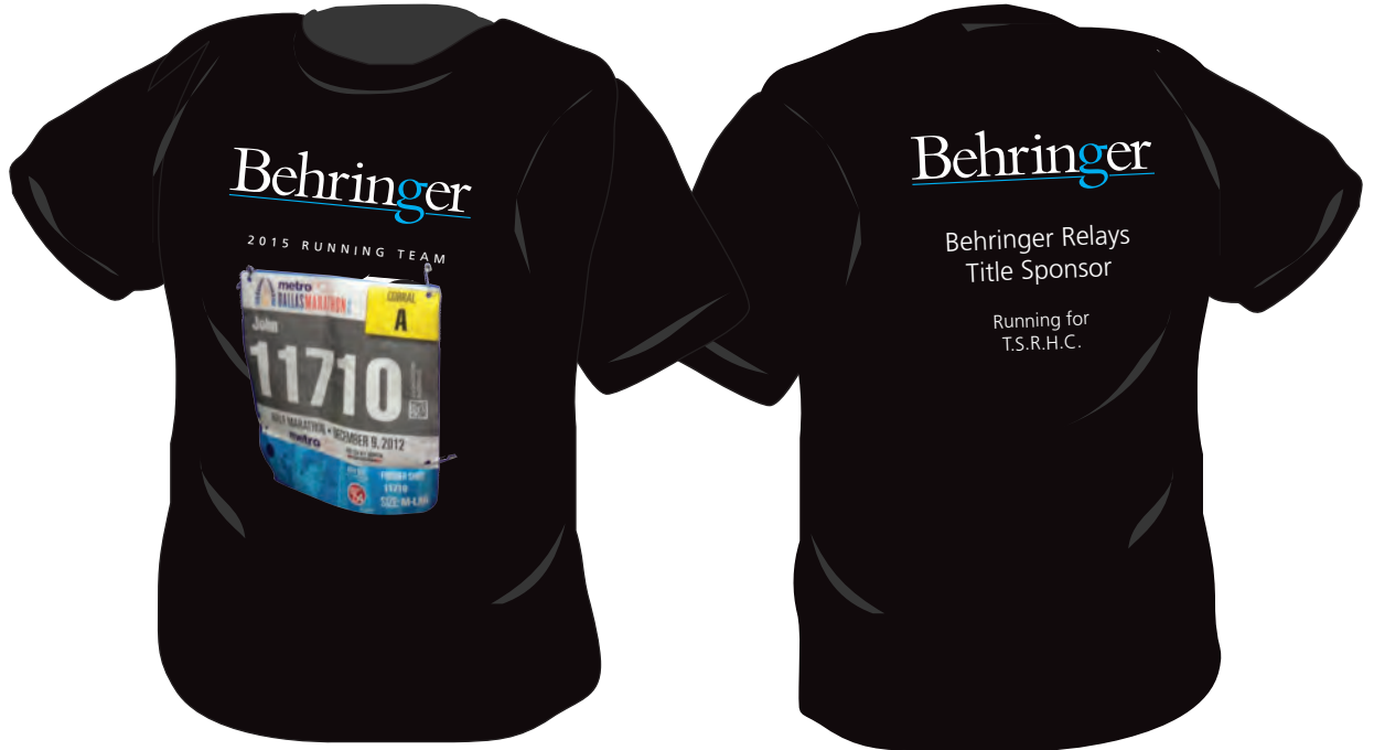
Behringer T-shirts for Dallas Marathon