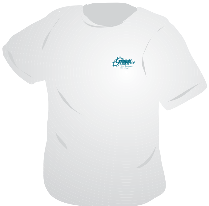
Grace Evangelical Free Church T-shirts design